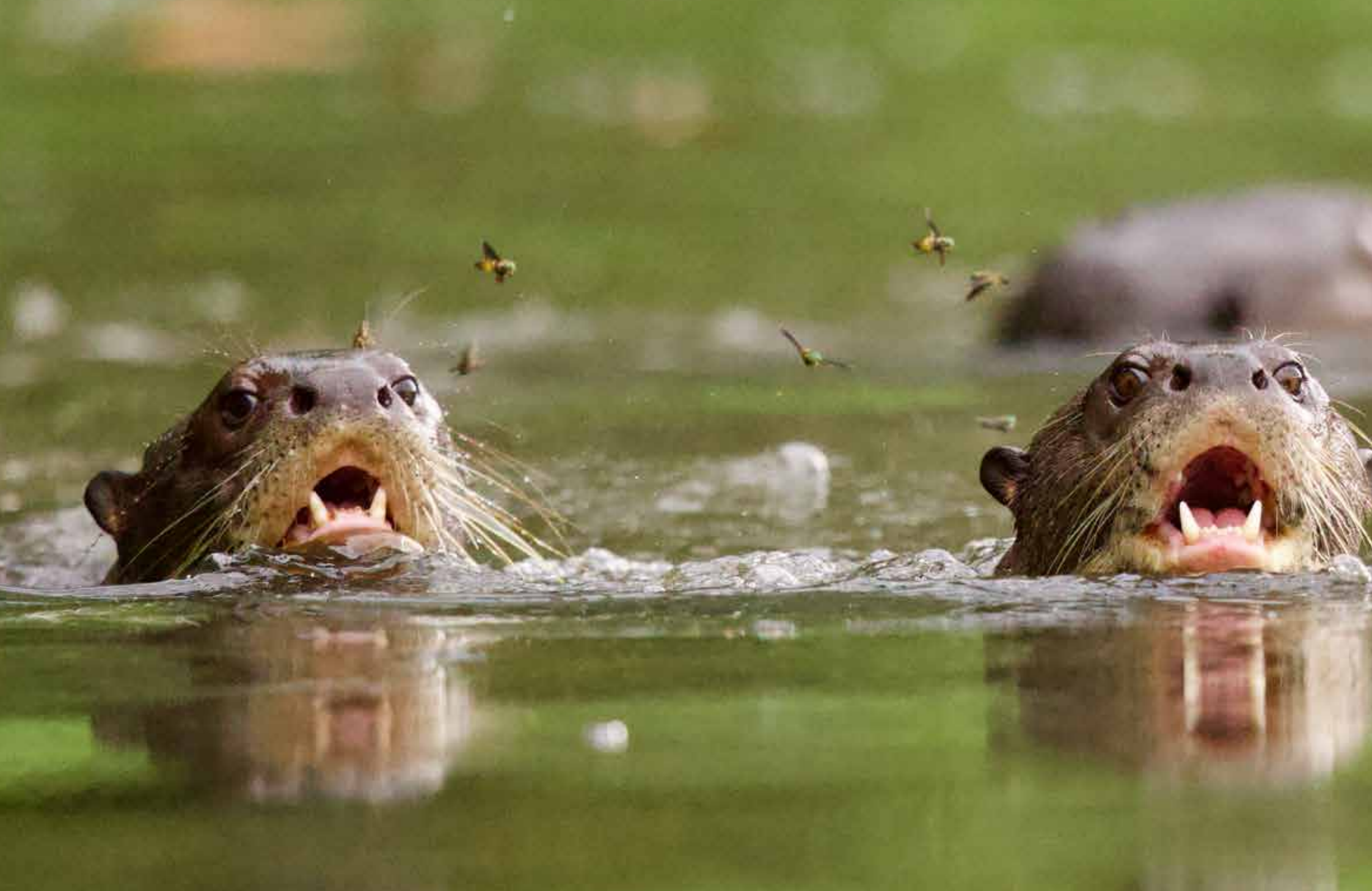
Giant Otter - Napo Wildlife Center