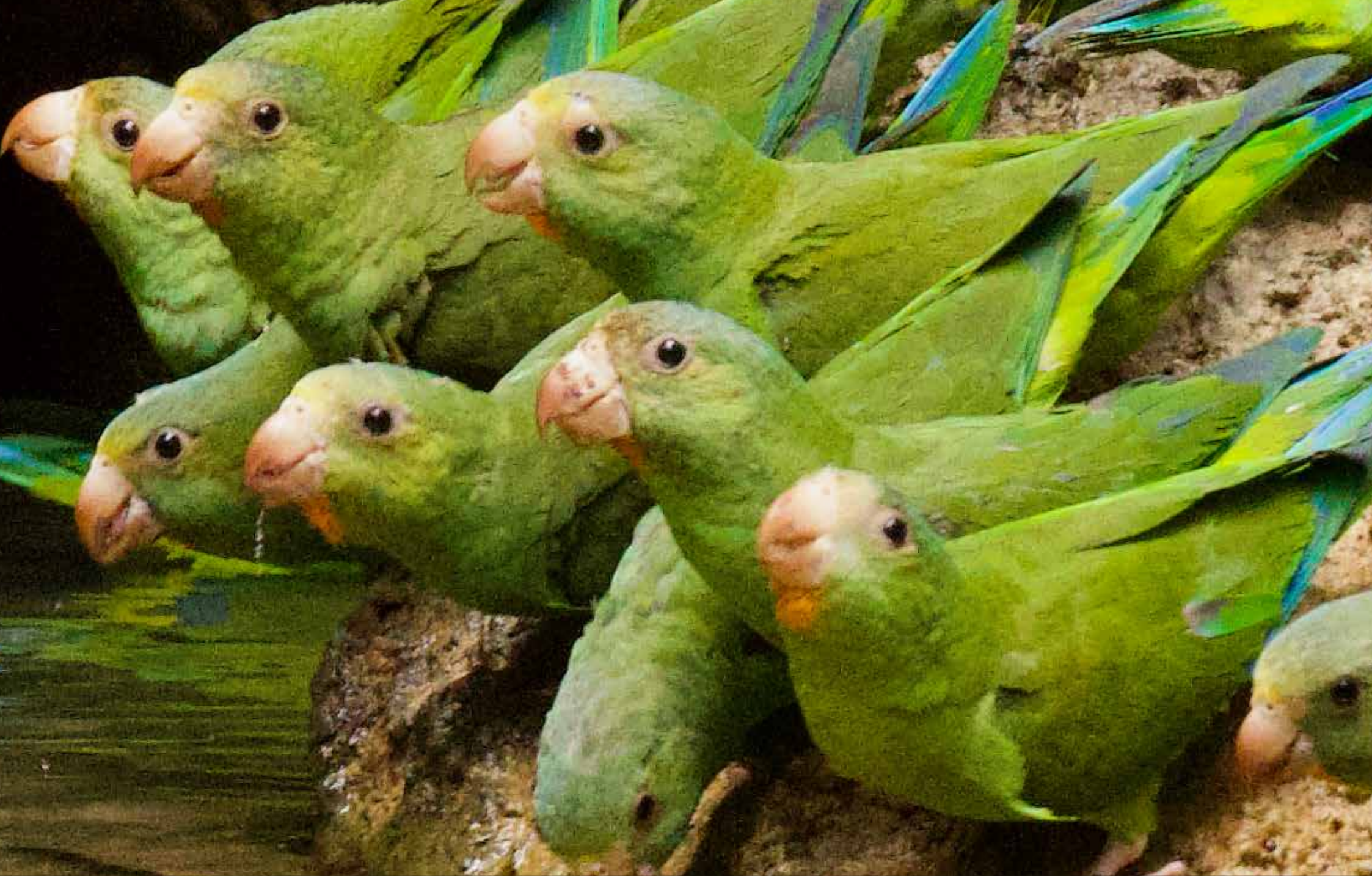
Cobalt-winged Parakeet - Napo Wildlife Center