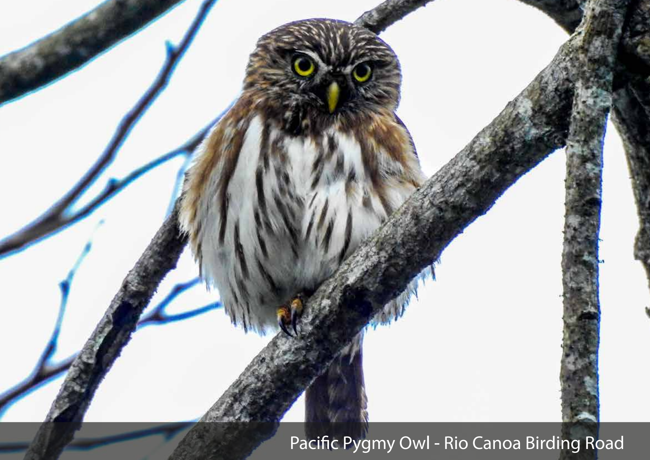
Pacific Pygmy Owl - Rio Canoa Birding Road