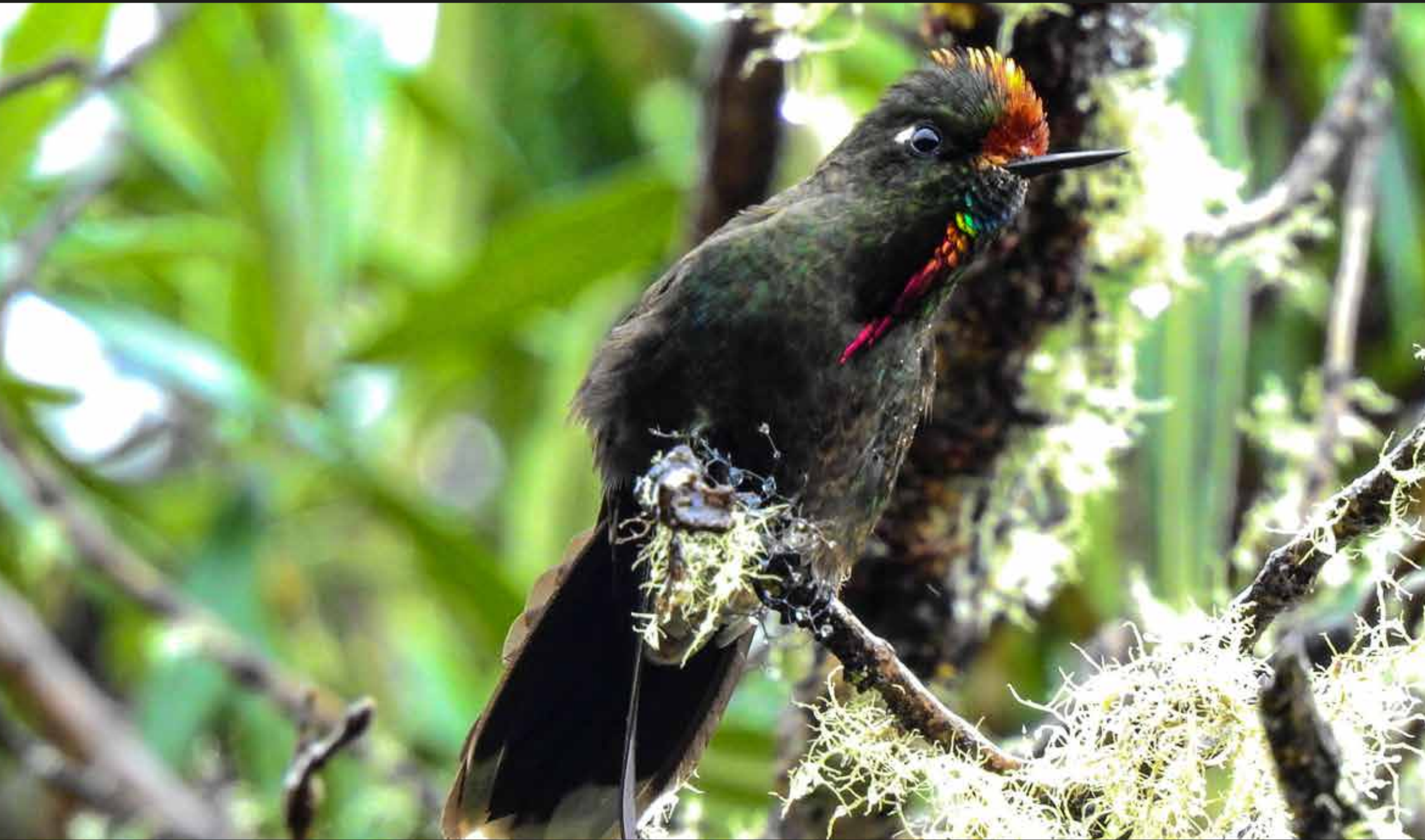
Rainbow bearded Thornbill - Penas Blancas Foothills