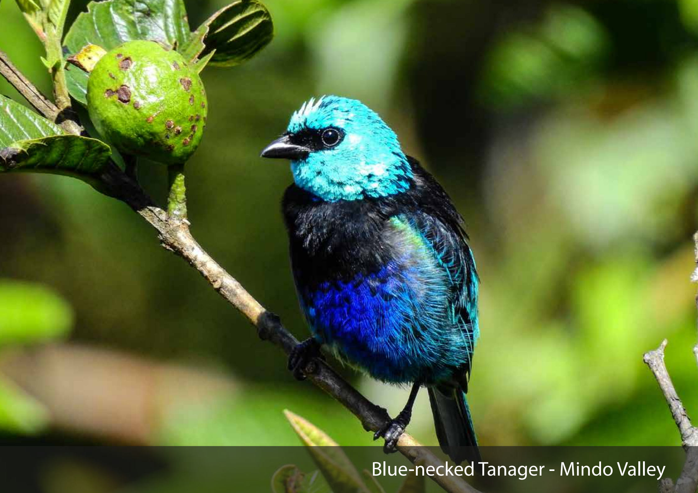
Blue-necked Tanager - Mindo Valley