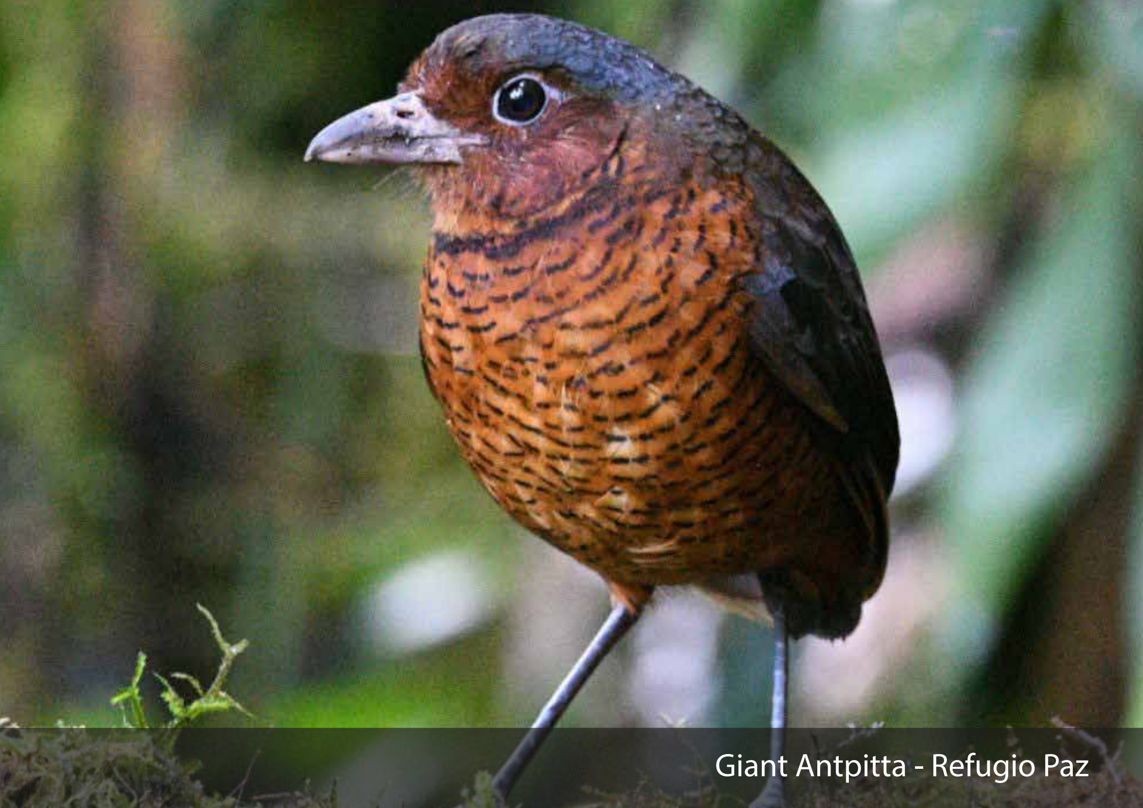
Giant Antpitta - Refugio Paz