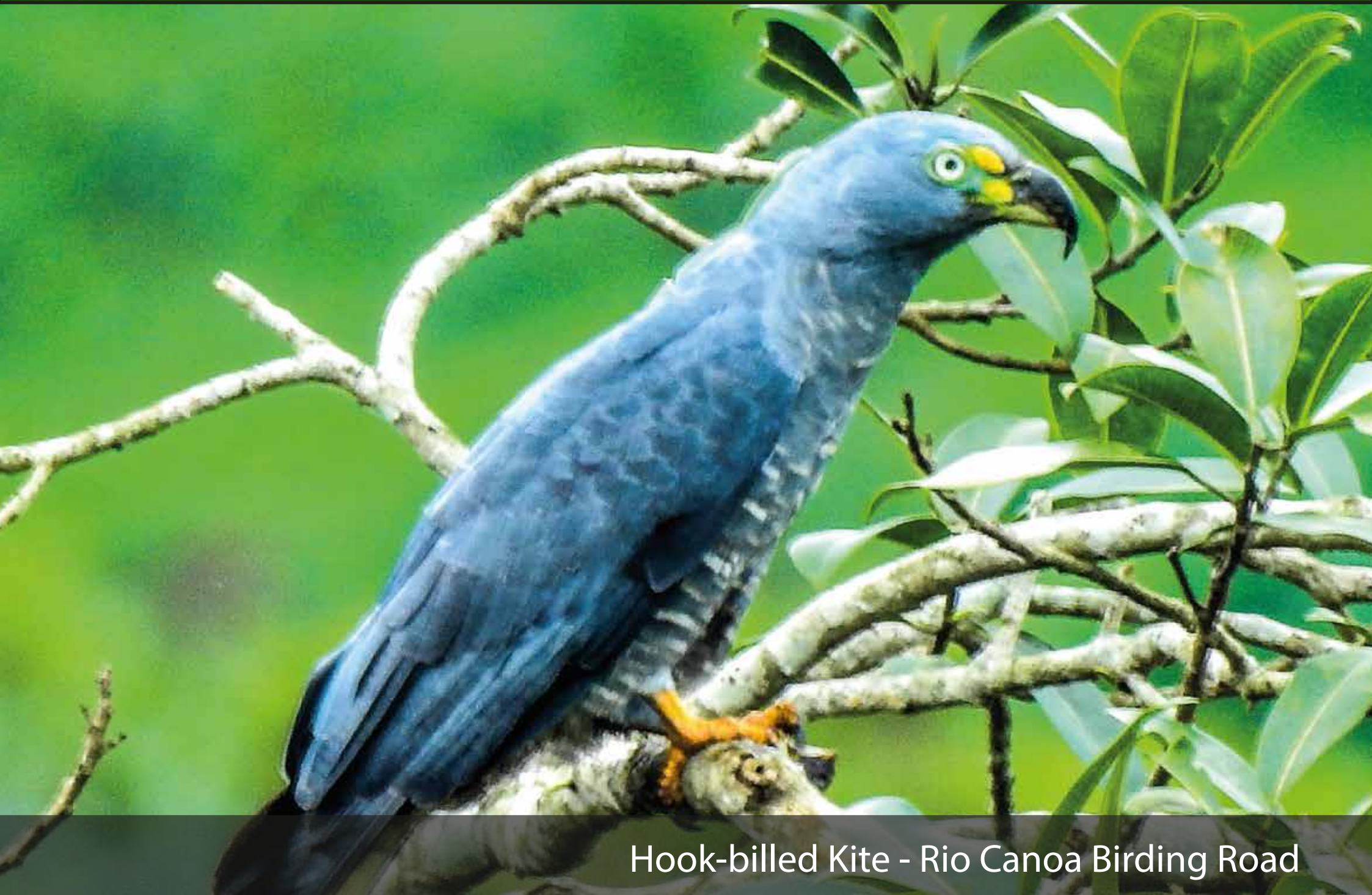
Hook-billed Kite - Rio Canoa Birding Road