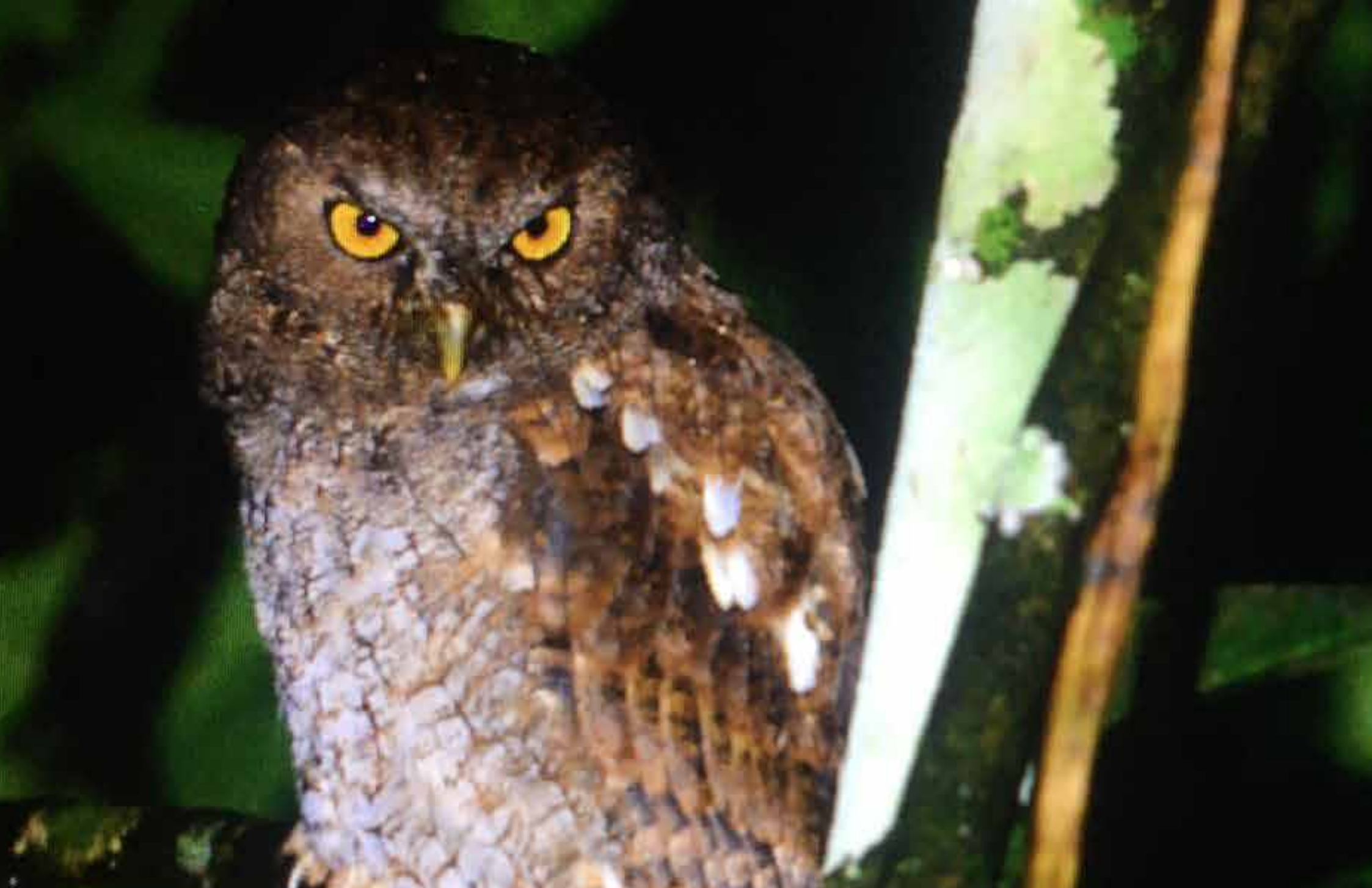
Tropical Screech Owl - Wild Sumaco Reserve