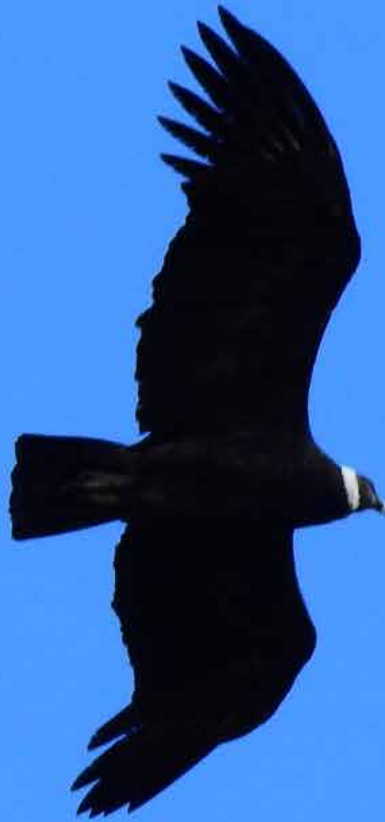
Andean Condor - Antisana National Park