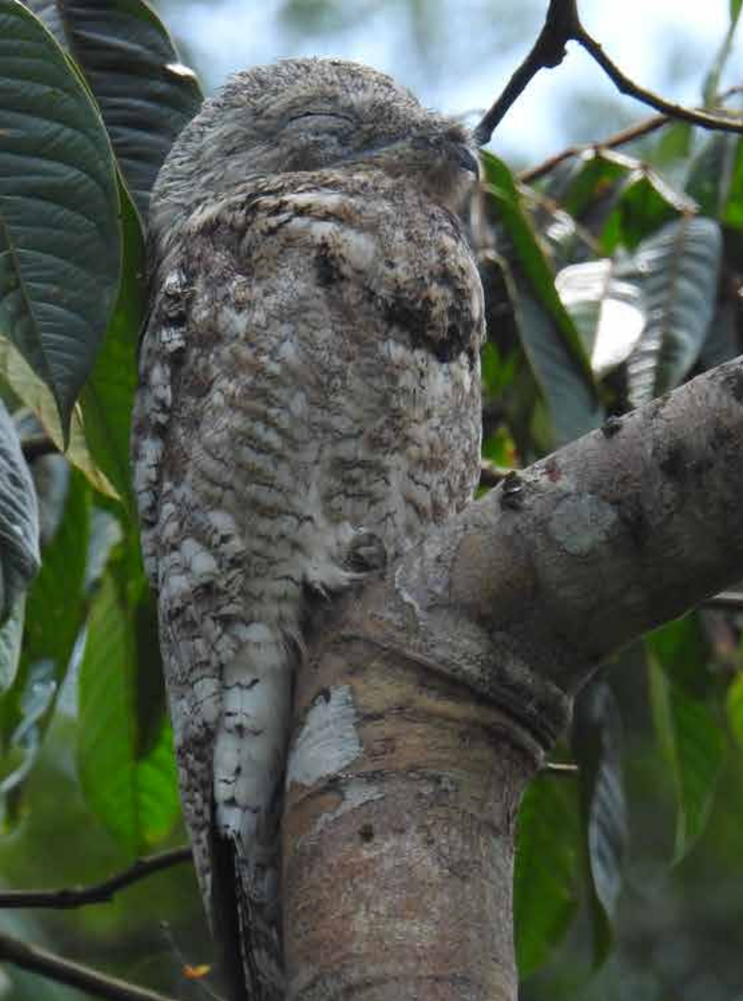
Great Potoo - Limoncocha Biological Reserve