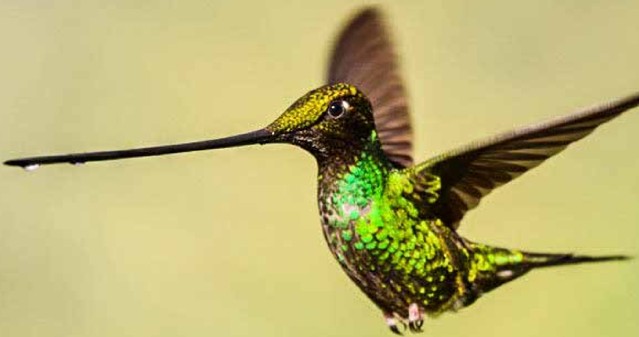
Sword-billed Hummingbird - Yanacocha Foothills