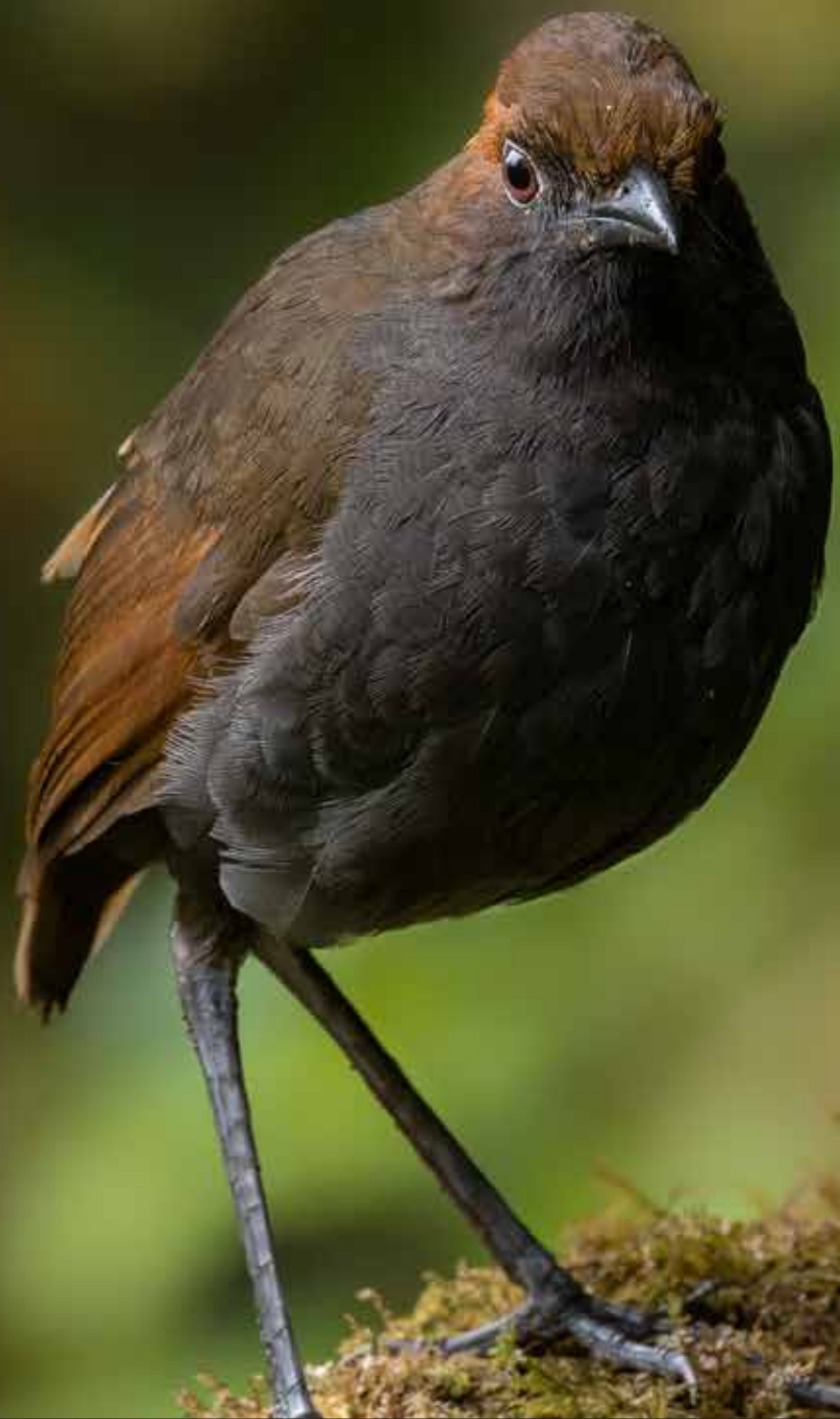
Chestnut-naped Antpitta - Yanacocha Foothills