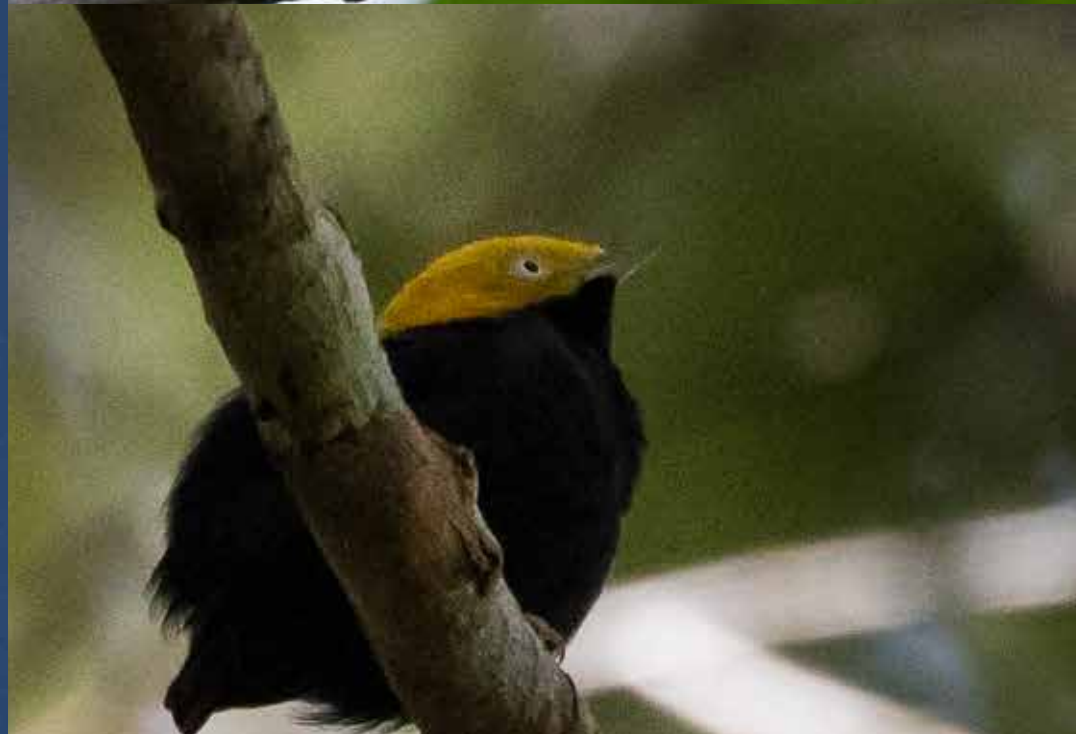
White-crowned Manakin & Golden-headed Manakin