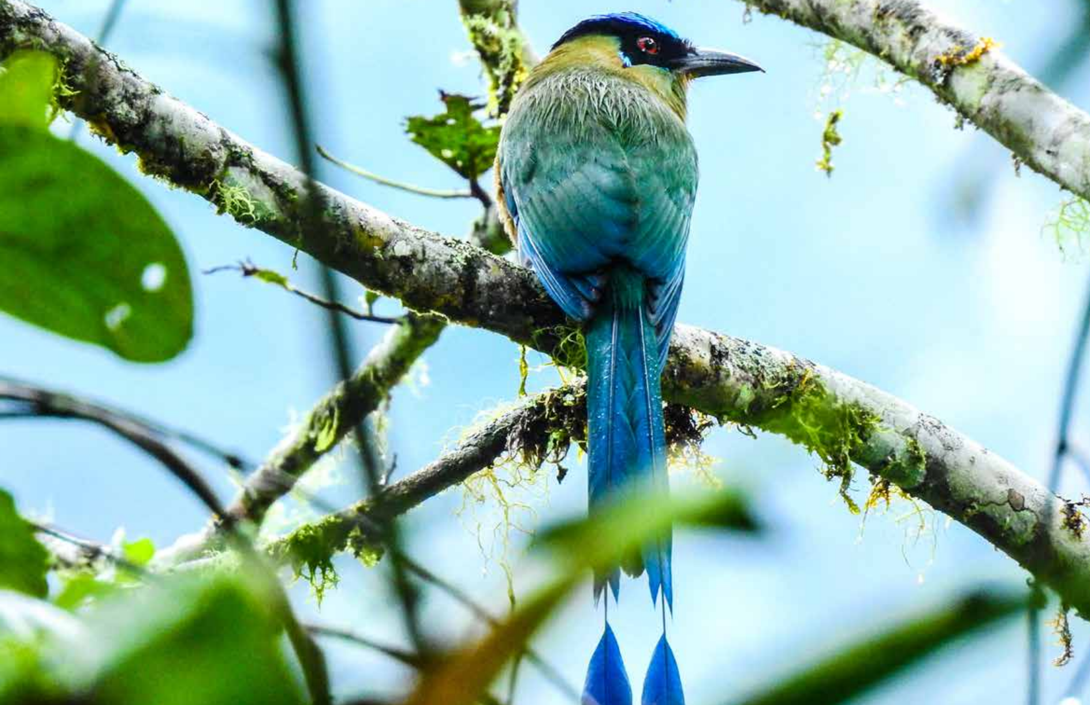
Andean Motmot - Quijos Reserve