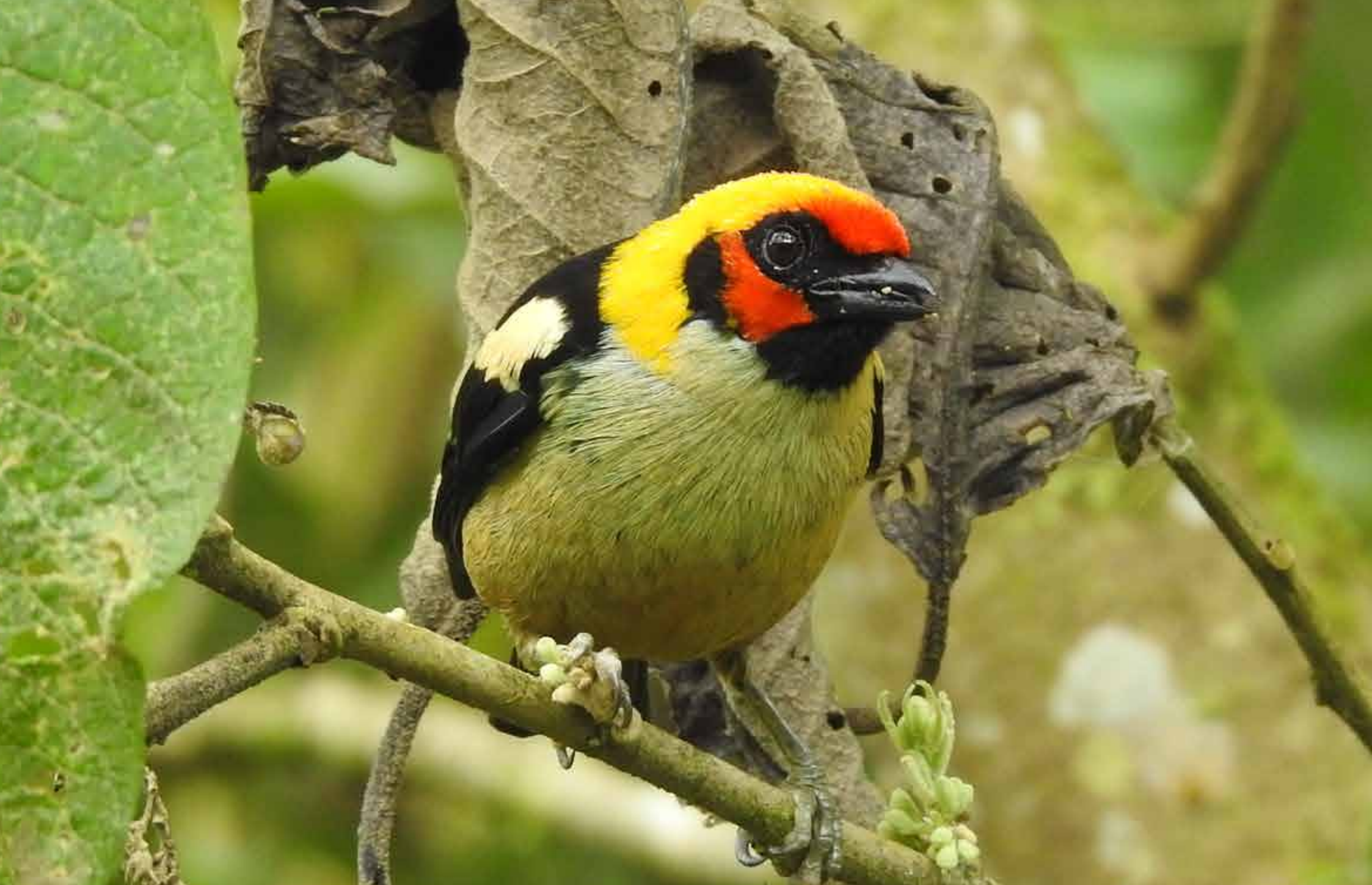
Flame-faced Tanager (East) - Brisas Feeders