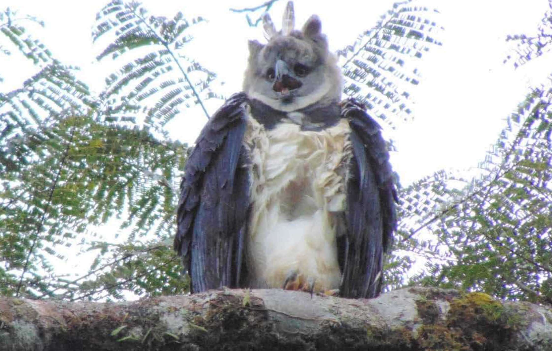
Harpy Eagle - Avila Viejo Reserve