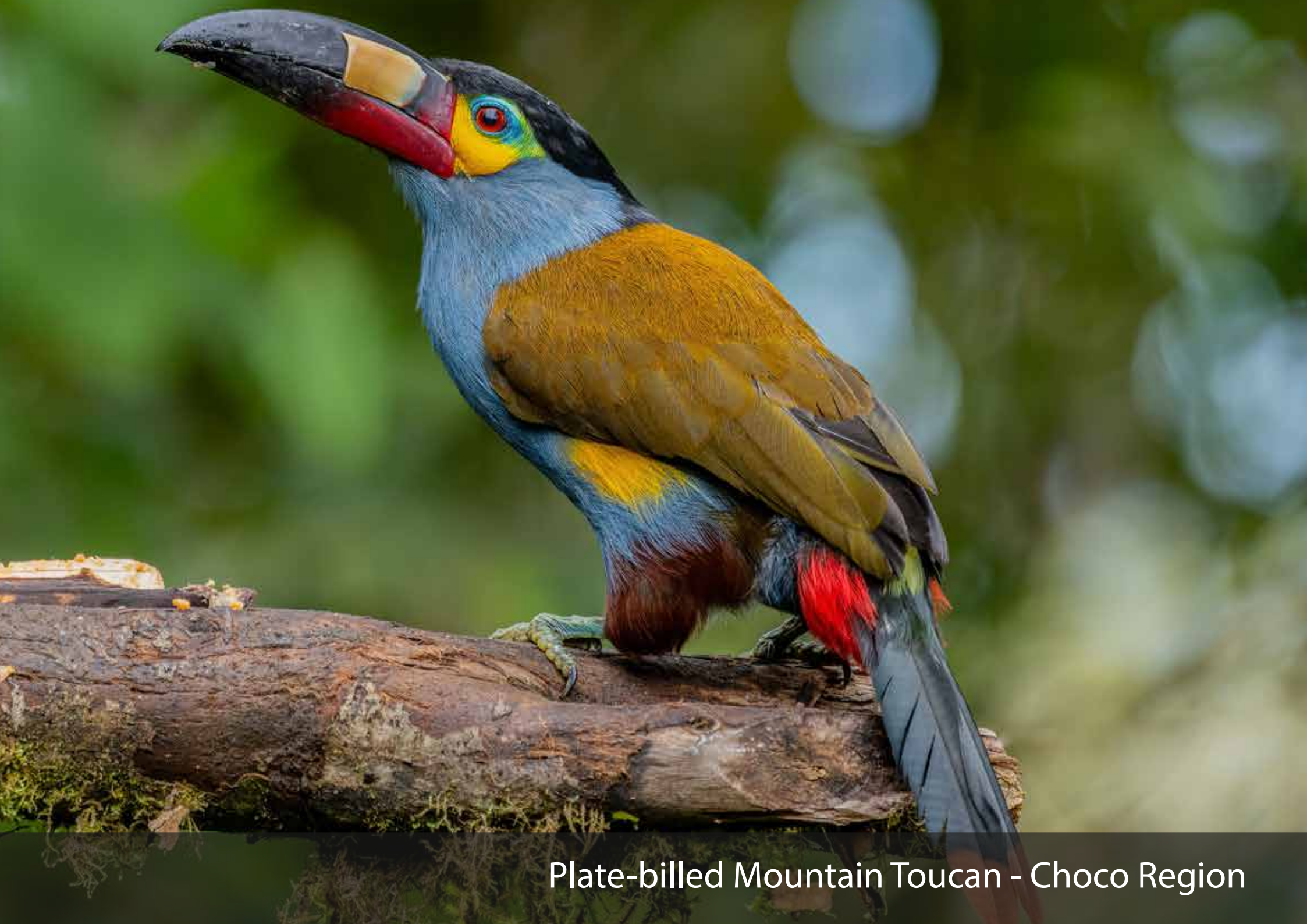
Plate-billed Mountain Toucan - Choco Region