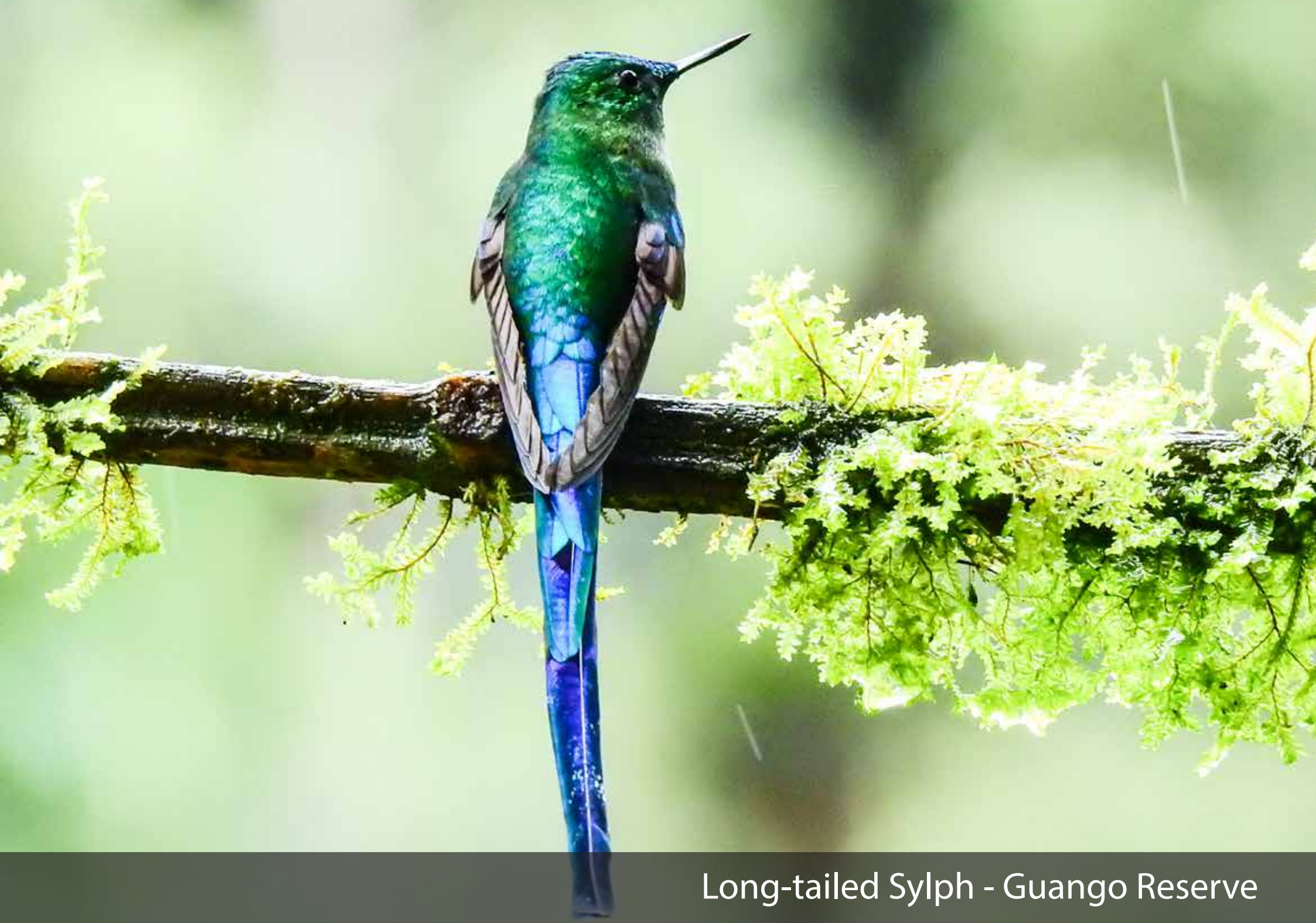
Long-tailed Sylph - Guango Reserve