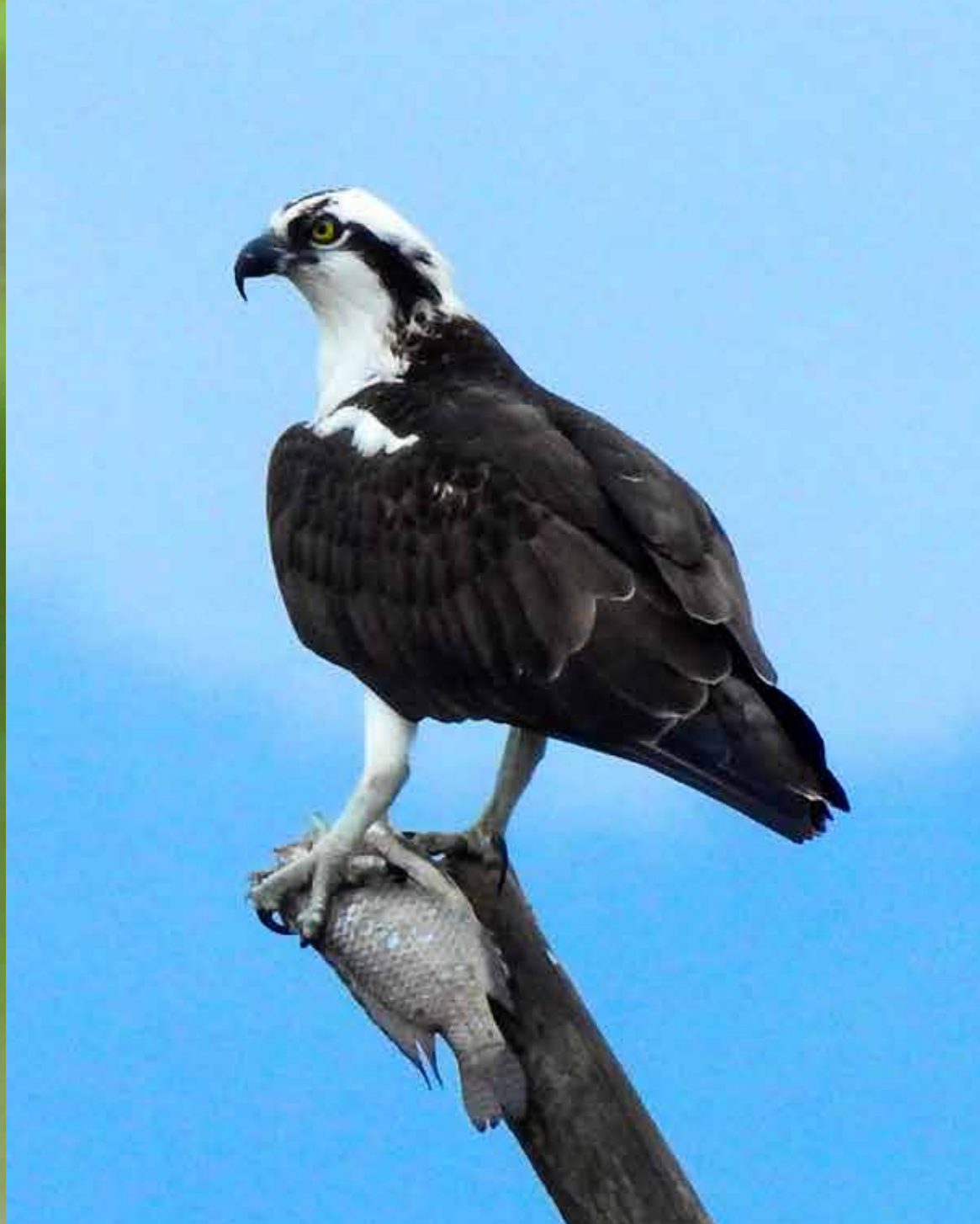
Snail Kite & Osprey - La Segua Marshes