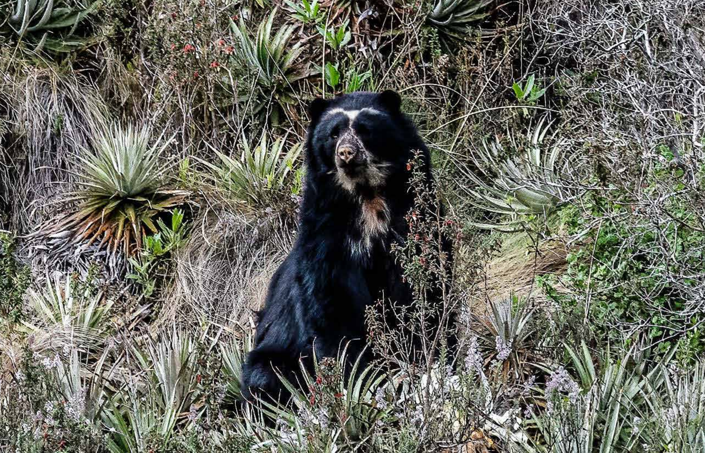
Andean Spectacled Bear - Papallacta Pass