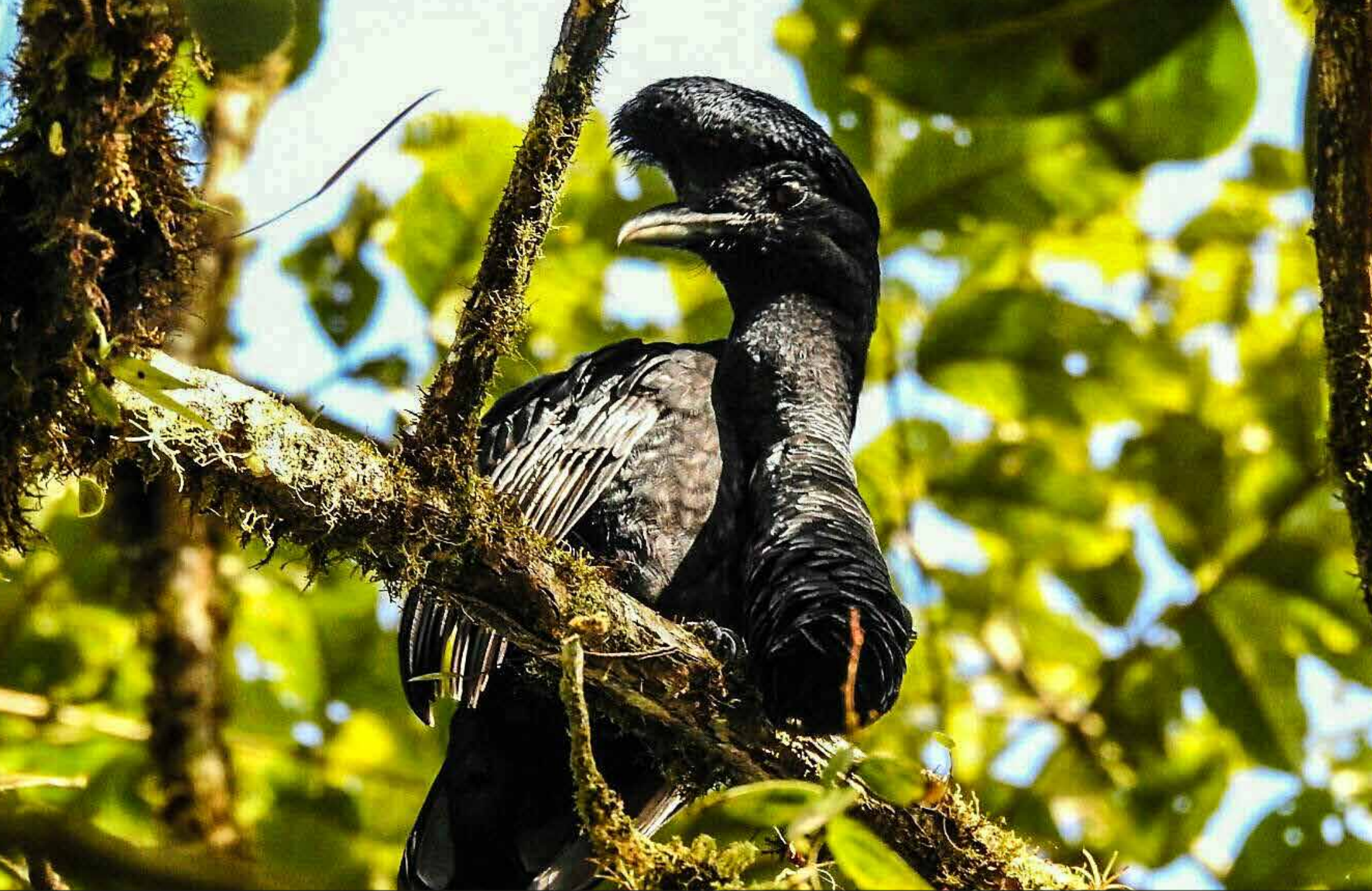
Long-wattled Umbrella Bird - Sachatamia Hide