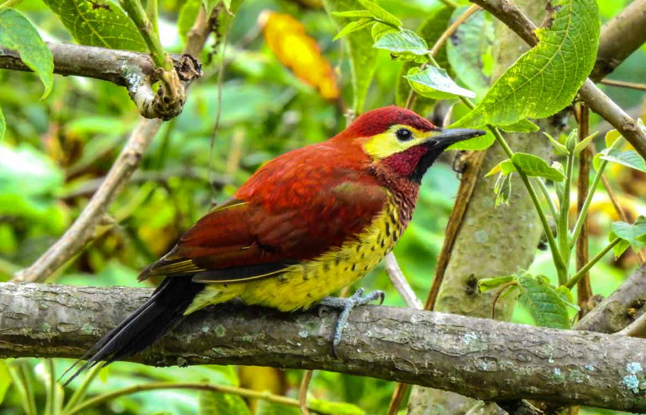
Crimson-mantled Woodpecker - Hacienda Jimenita