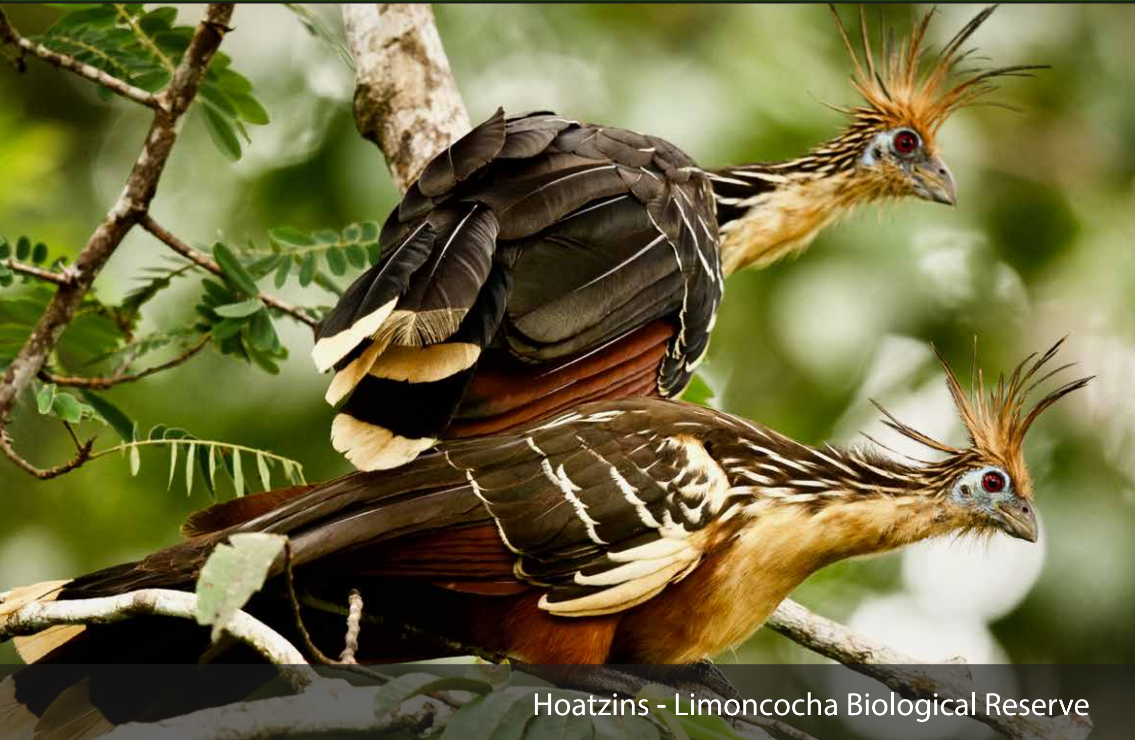
Hoatzins - Limoncocha Biological Reserve