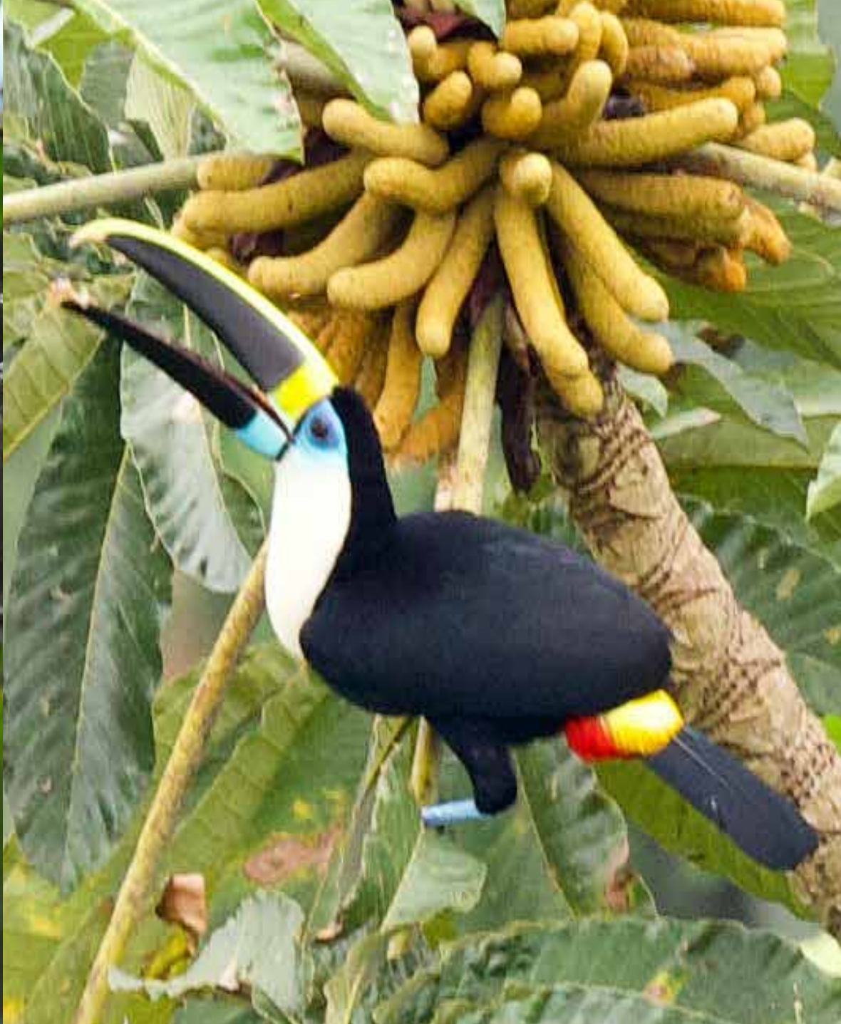
White-throated Toucan - Yasuni National Park