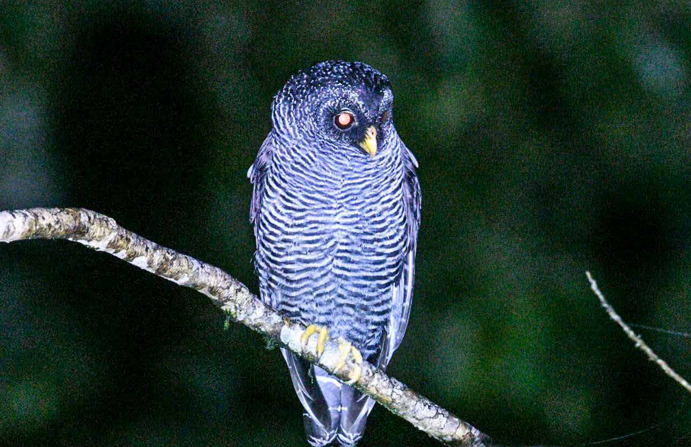
Black-banded Owl - San Isidro Reserve