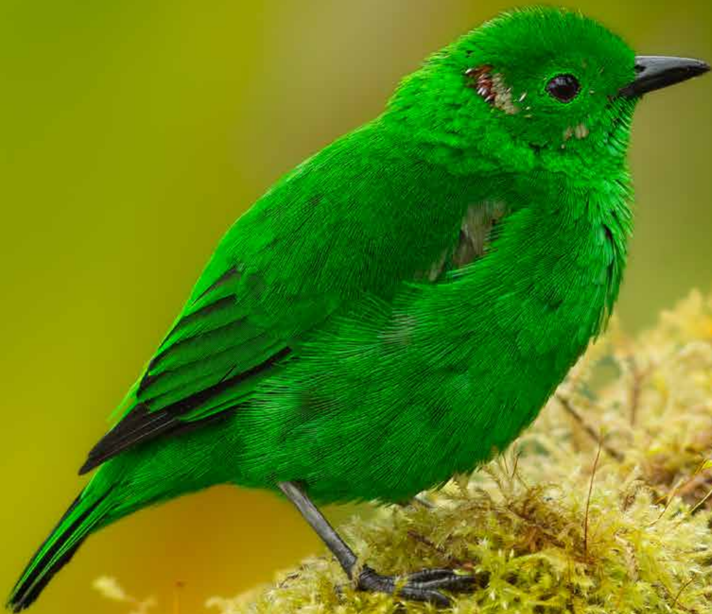
Green-glistening Tanager - Mashpi Amagusa Reserve