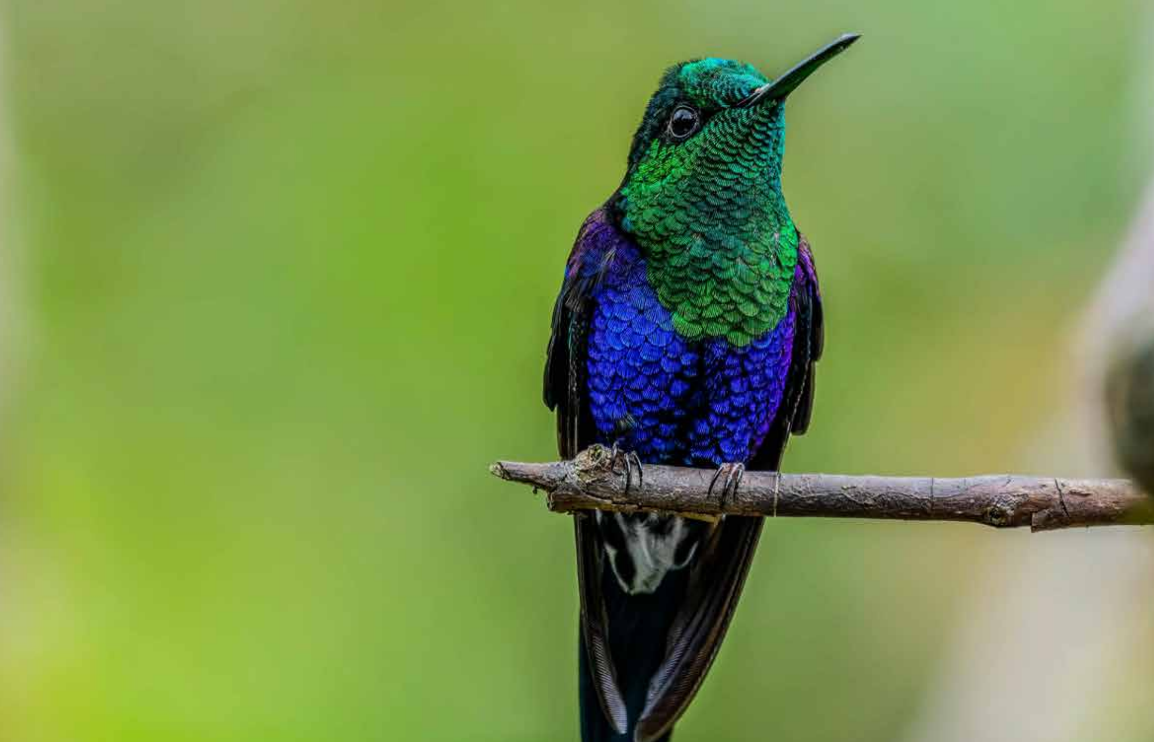
Green-crowned Woodnymph - Alambi Paradise