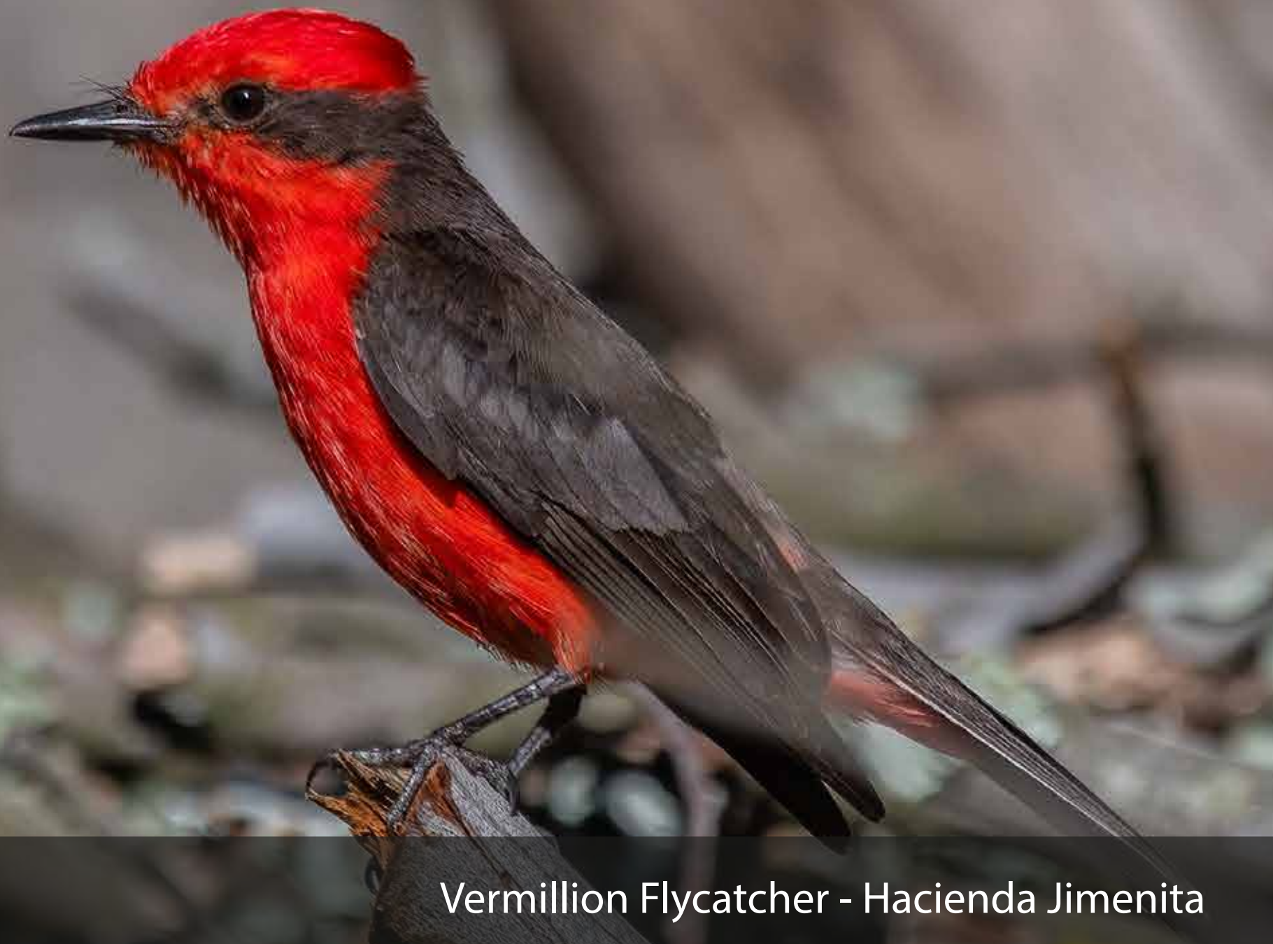
Vermillion Flycatcher - Hacienda Jimenita