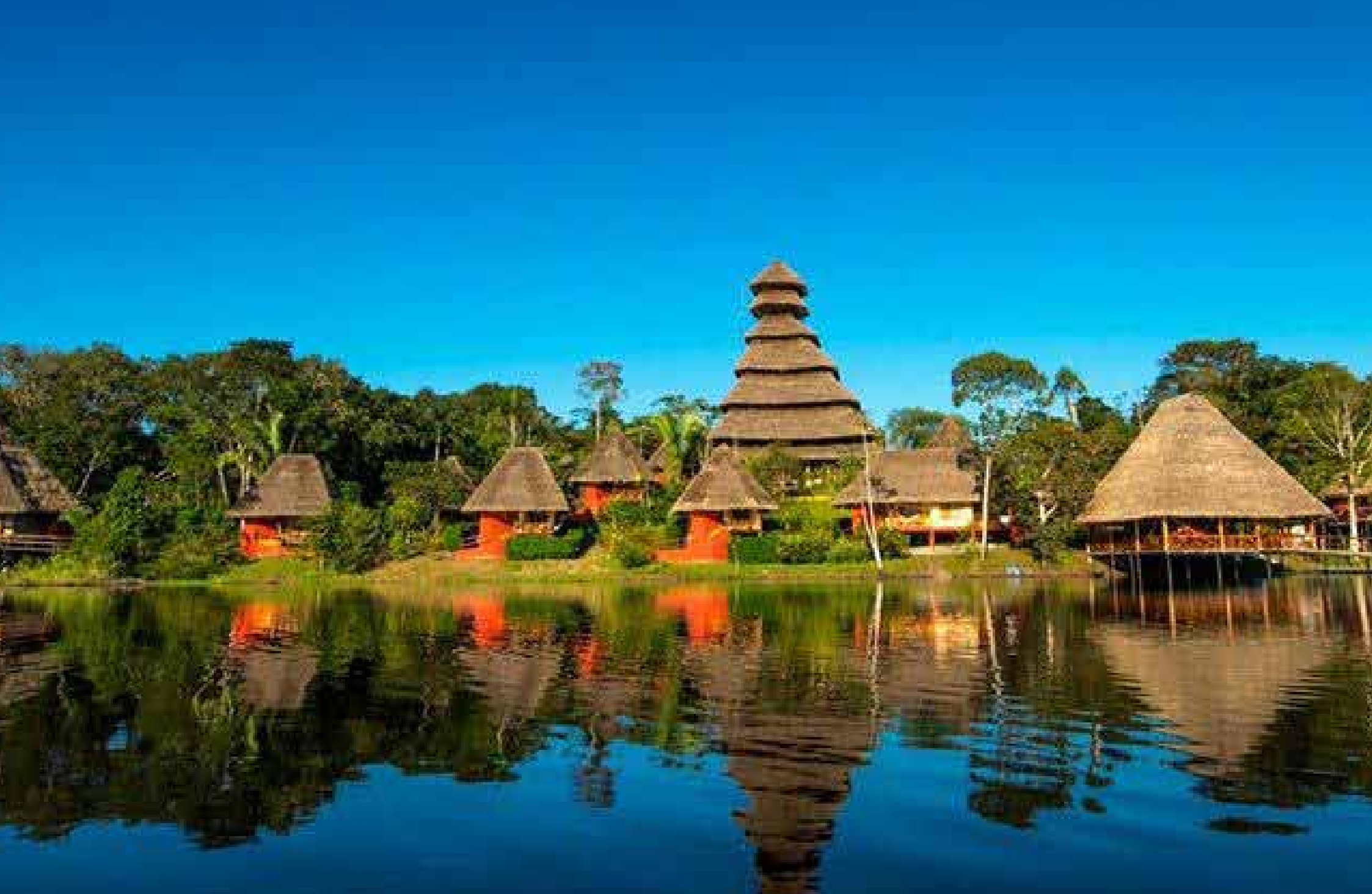
Napo Wildlife Center - Yasuni National Park