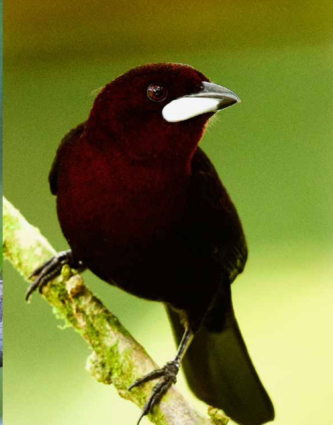
Gilded Barbet & Silver-beaked Tanager - Wild Sumaco Reserve