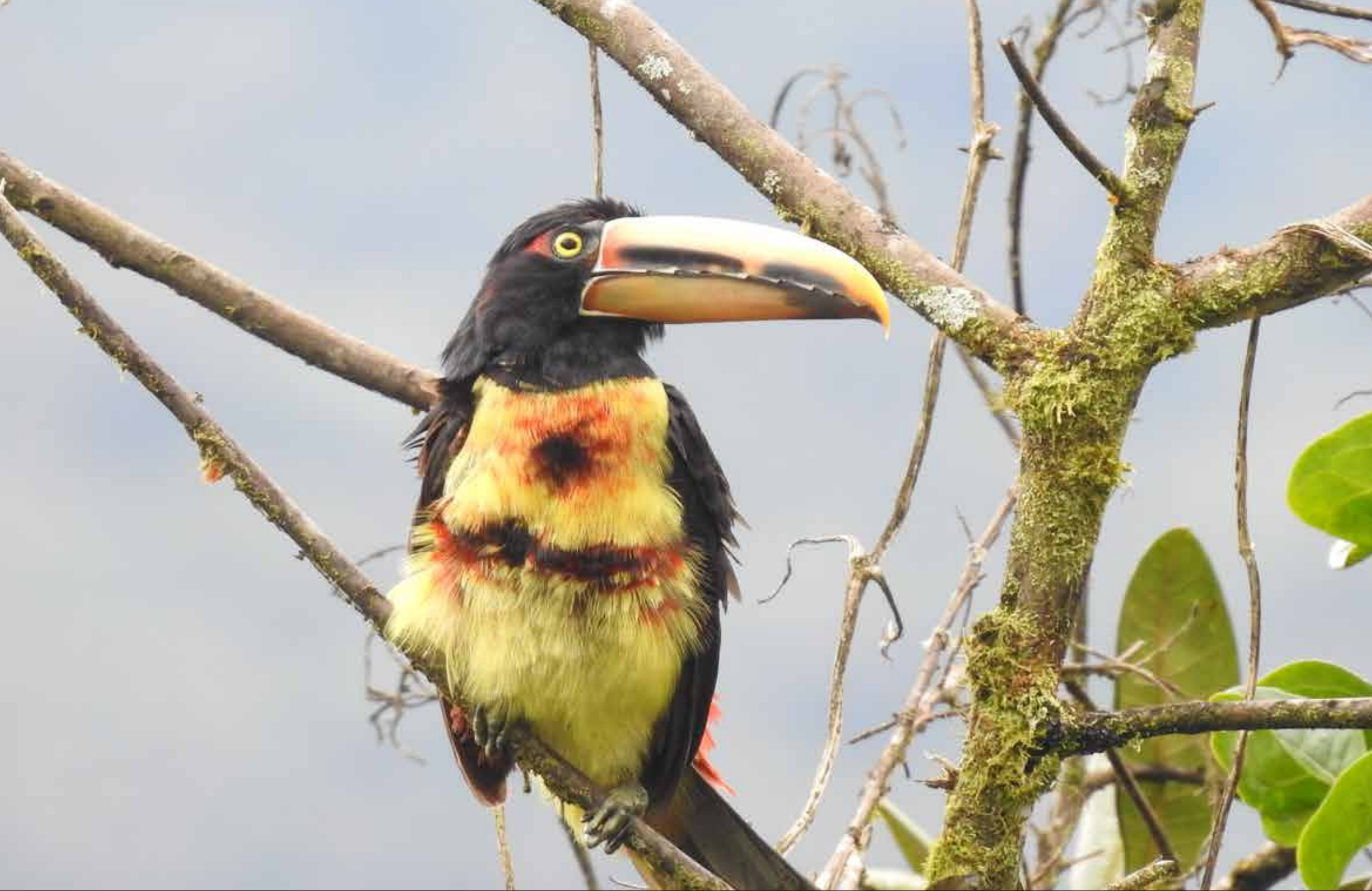
Pale-mandibled Aracari - Milpe Birding Sanctuary