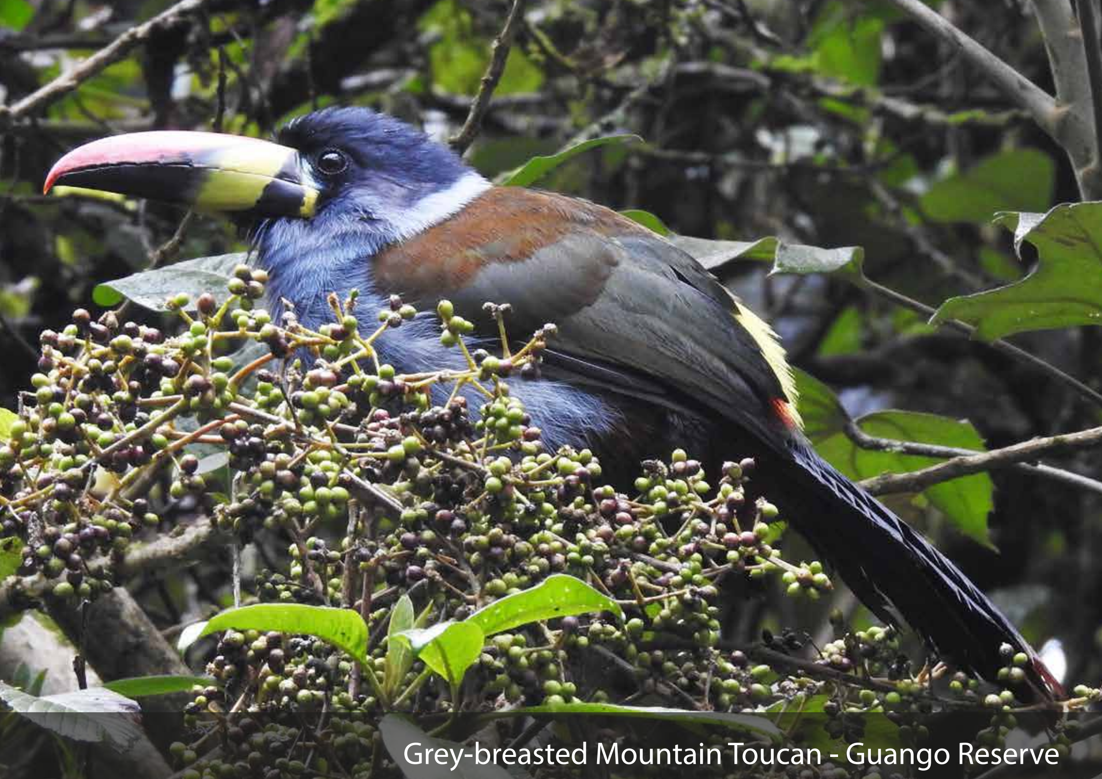
Grey-breasted Mountain Toucan - Guango Reserve