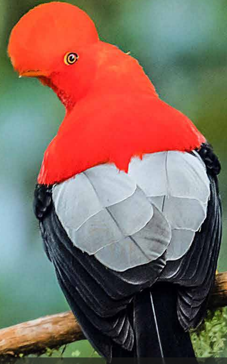
Andean Cock of the Rock - Refugio Paz