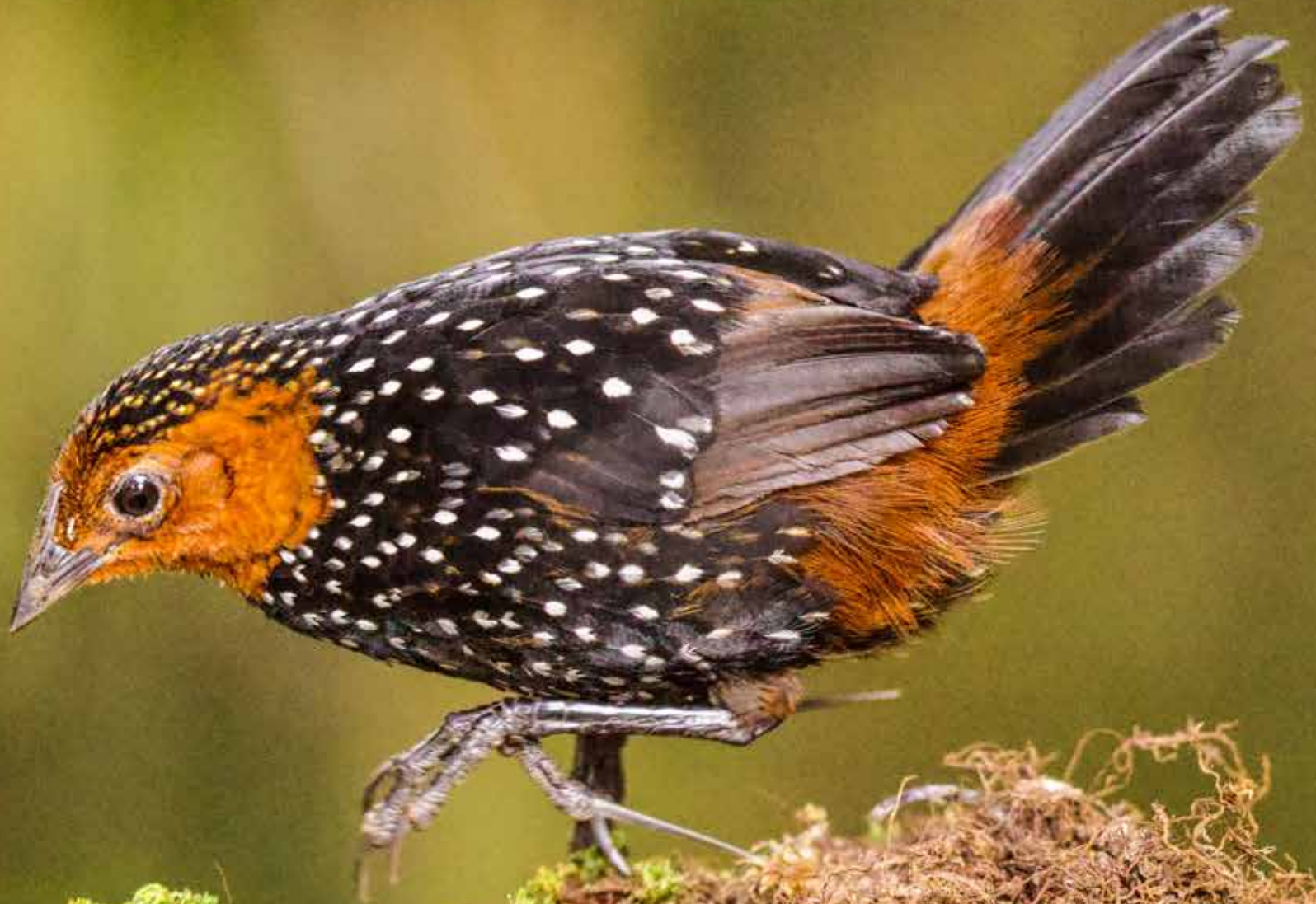
Ocellated Tapaculo - Yanacocha Foothills