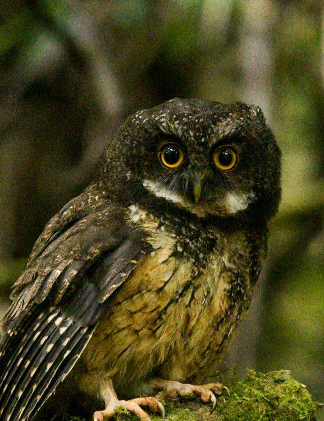
White-throated Screech Owl