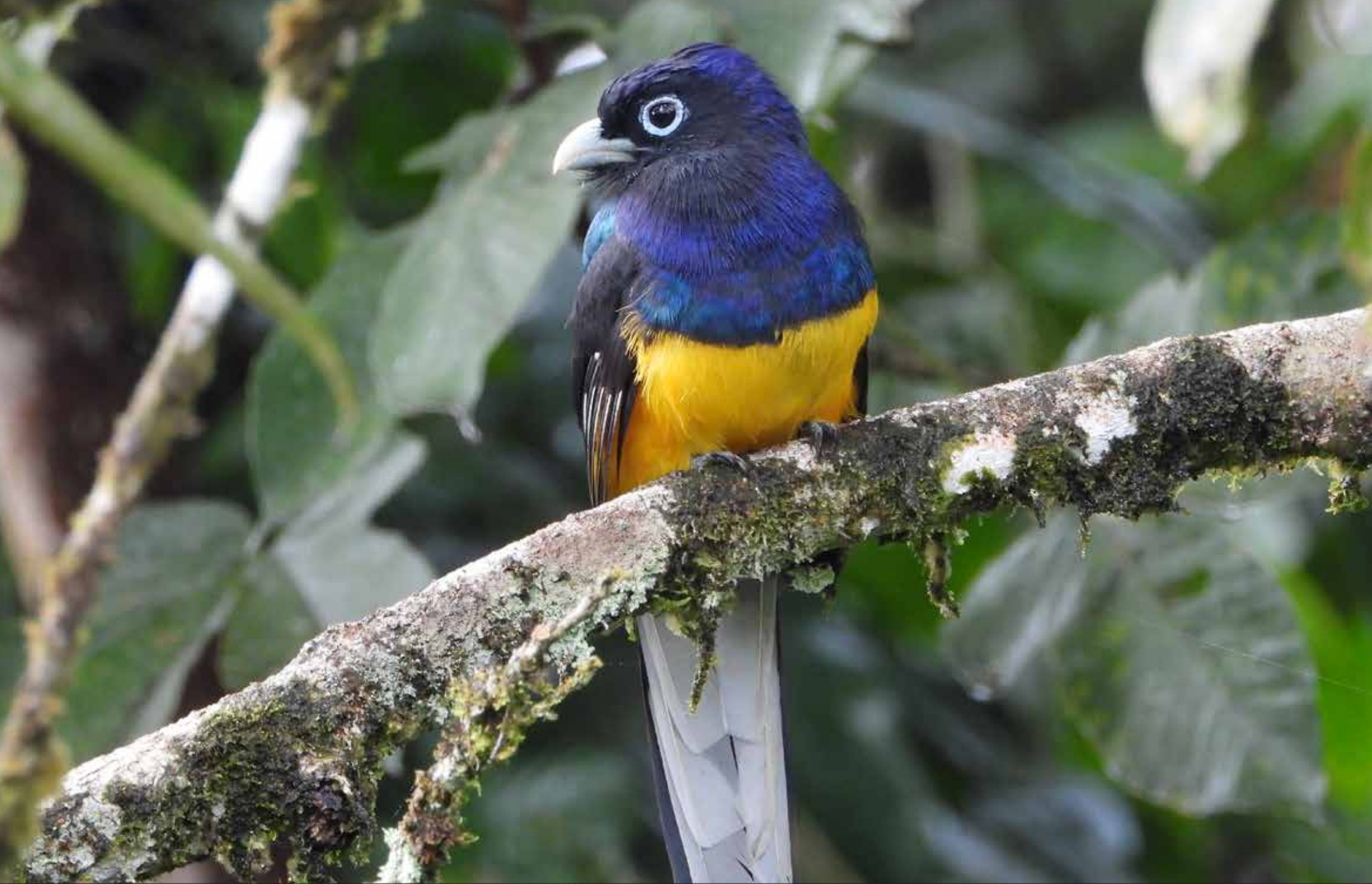
White-tailed Trogon - Wild Sumaco Reserve