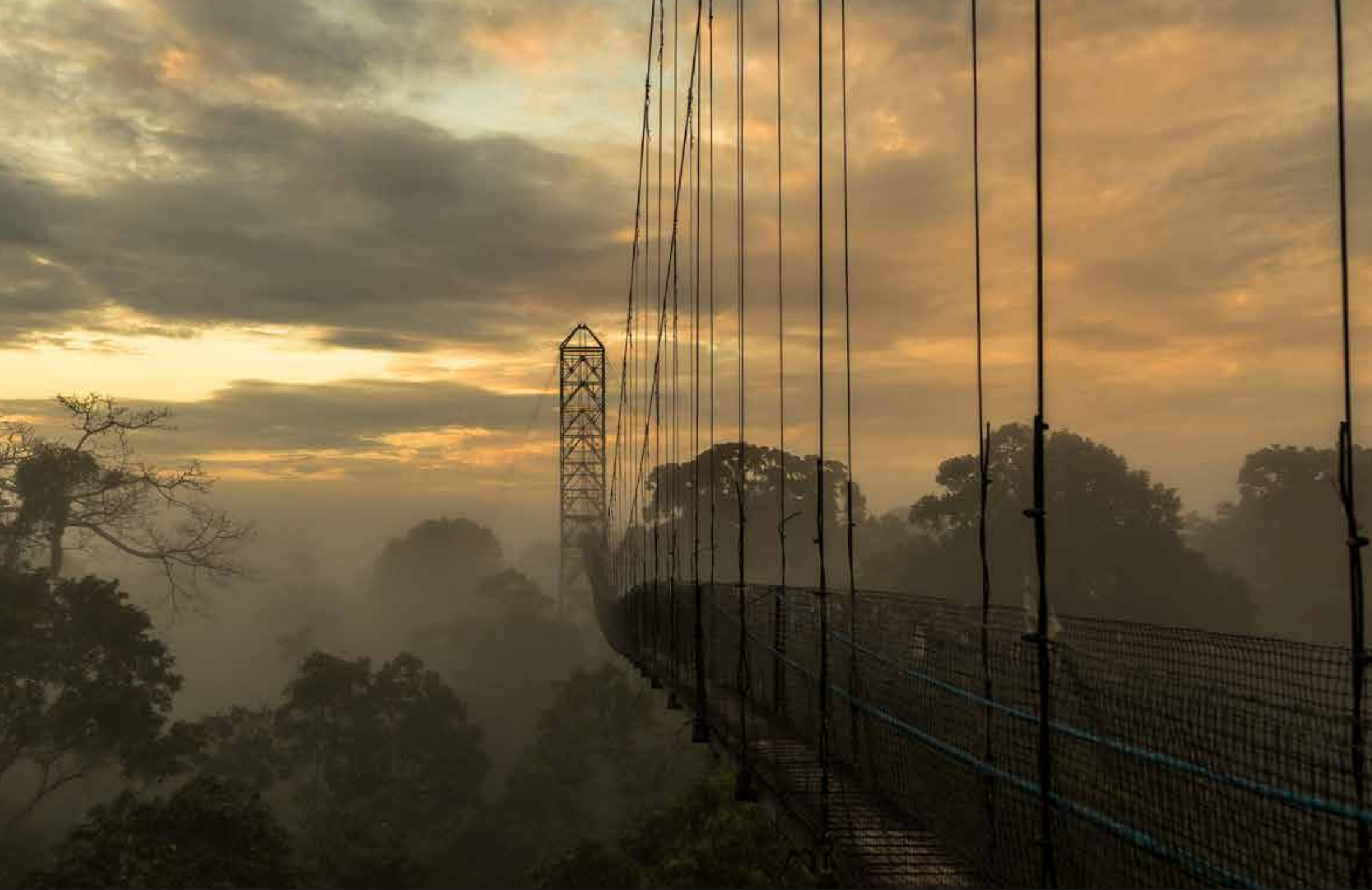
Sacha Lodge - Yasuni National Park