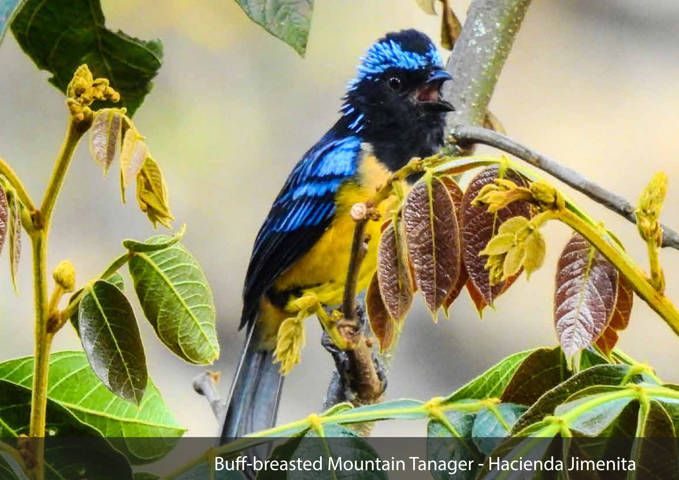
Buff-breasted Mountain Tanager - Hacienda Jimenita