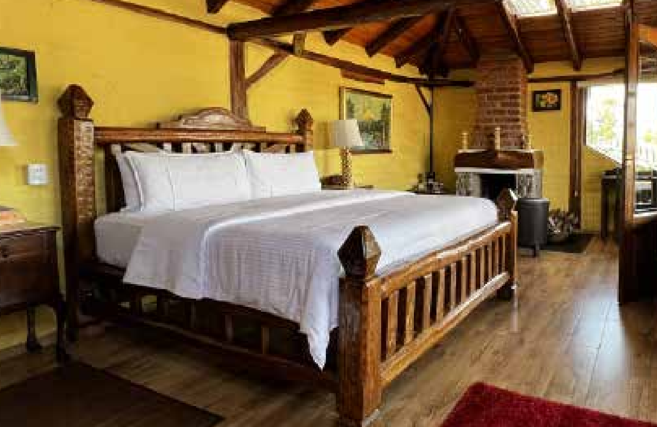
Hacienda Jimenita Lodge