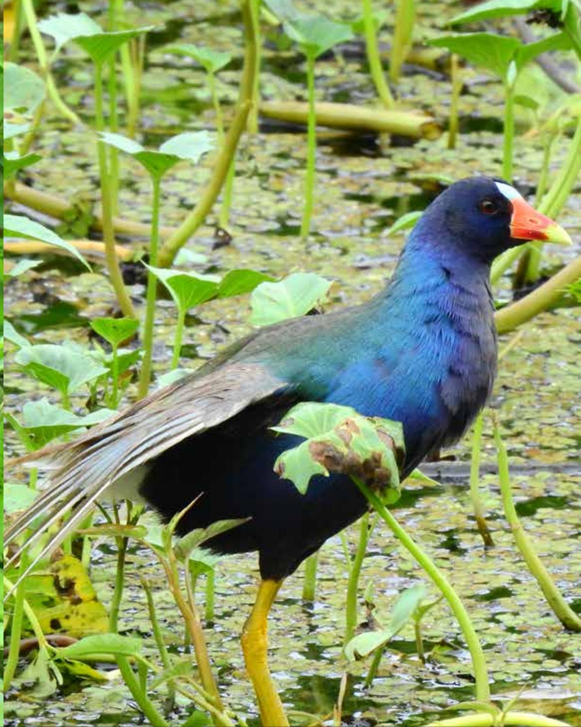
Least Sunbittern & Purple Gallinule - La Segua Marshes